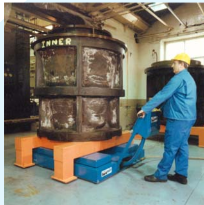
12 tonne capacity transporter picks up and manoeuvres loads for Granada Material Handling

They usually incorporate four or more air bearings in a single fabricated structural steel chassis, the size of which is determined by the application. The pneumatic control system for the air bearings and other accessories such as drive units, secondary lifting beams and guide wheels are all incorporated in the transporter chassis. Operator control options include umbilical, hard mounted, and remote controlled units. More information on bespoke designed transporter platforms and available options is available in the leaflet 'Air Film Transporters'