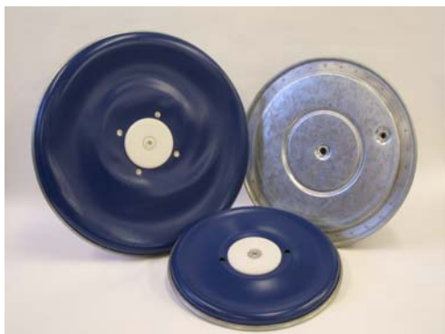
There are three sizes of Hovair LA bearings available

Optional accessories include remote control boxes with 'dead-man' on/off trigger and quick exhaust, LA spacer blocks, allowing the bearing to be mounted underneath a flat face without the air inlet being obstructed. There are also quick-release hoses and fittings for when speed of fitting is important.