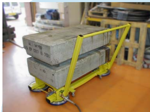
A simple 1,600kg capacity platform with four LA12 bearings